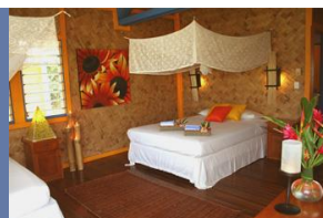
Personable & Intimate