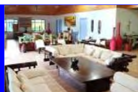
Comfort & Style