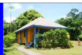
Personable & Intimate