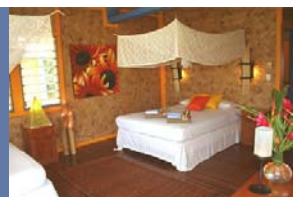
Personable & Intimate