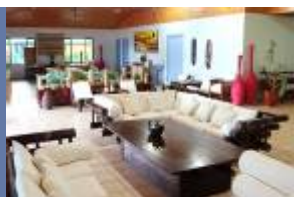
Comfort & Style